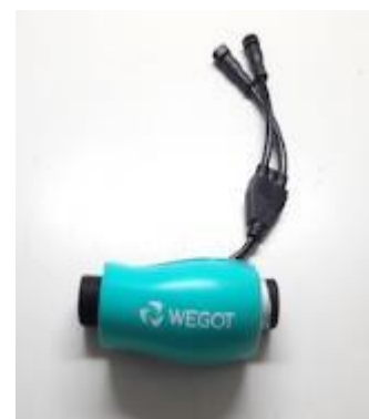
WEGoT Ultrasonic Sensor

WEGoT, which was launched in 2015, calculates that its systems in more than 30,000 homes and 40 million square feet of commercial space have saved more than 3 billion liters of water. With a goal of saving another 10 billion-plus liters in the next three years, WEGoT and Kerlink plan to deploy the system in a million more homes and more than 5,000 commercial and industrial facilities by 2024.