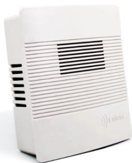
LoRaWAN® ambient transmitter “TX CO2 VOC T&H Amb 600-023” Enless Wireless ©2022

The system used technology jointly developed by Kerlink (AKLK – FR0013156007), a specialist in solutions dedicated to the Internet of Things (IoT), Microshare , a provider of a leading data-management solutions for the IoT era, and Enless Wireless , a major manufacturer of intelligent self-powered sensors, communicating in radio mode and dedicated to energy performance & comfort applications in buildings.