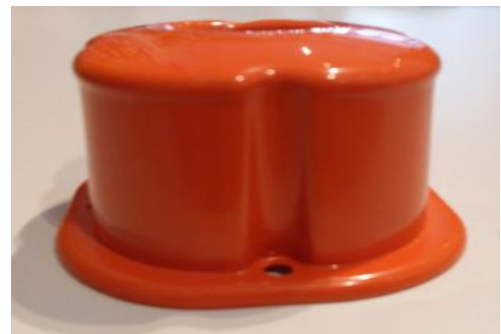
Figure 1 DUT Setup