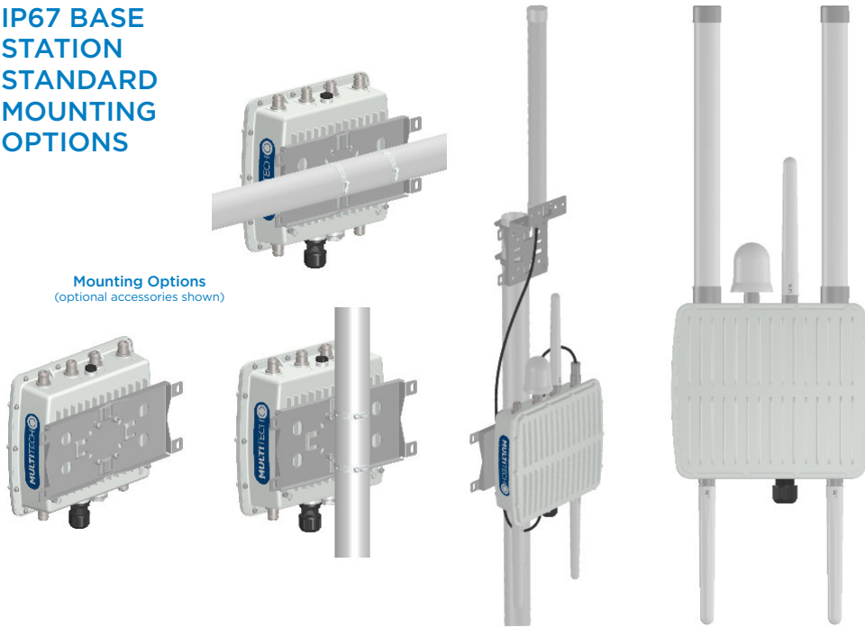
Mounting Options (optional accessories shown)