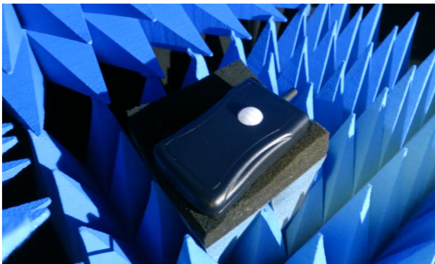
Figure 1 DUT Setup