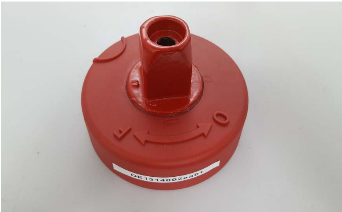
Object Under Test