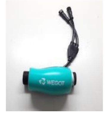
WEGoT Ultrasonic Sensor

WEGoT, which was launched in 2015, calculates that its systems in more than 30,000 homes and 40 million square feet of commercial space have saved more than 3 billion liters of water. With a goal of saving another 10 billion-plus liters in the next