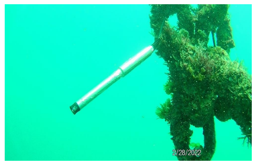
Aqualabo PHEHT sensor to measure seawater pH

The system transfers continuous seawater data over a private IoT network by Kerlink's industrial grade <u>Wirnet™ iStation</u> outdoor gateways. Data are then instantly and securely transferred to a private IoT platform in the government's datacenter. The data of various critical seawater parameters (temperature, pH, redox potential, conductivity, salinity, turbidity, and dissolved-oxygen level) are displayed in the form of a dynamic graph/timeline that highlights targeted levels and critical thresholds for government specialists' analysis and decision-making.