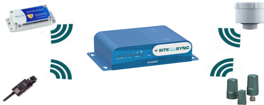
Figure 1. LoRaWAN end devices with a SiteSync LoRaWAN Conduit gateway.

LoRaWAN is the wireless technology that was created for large scale, Internet of Things deployments that covers long ranges and runs on low power. By optimizing battery life, distance covered, and maximizing the number of sensors that can be used on gateways, LoRaWAN is the technology that makes previously inaccessible data affordable for use in Industry 4.0. LoRaWAN is also an open protocol so multiple sensors can be deployed on the same network infrastructure, allowing for scalability. For more information on LoRaWAN, check out our website resource here: https://sitesync.cloud/lorawan/